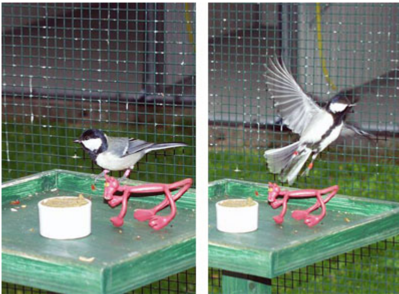
Fig. 2: A hungry great tit is interested in the food on the table (left), but will remain hungry if he is too shy to approach the unknown object (right).

In the Drd4 gene of this bird, they discovered 73 polymorphisms, of which 66 were so-called Single Nucleotide Polymorphisms (SNPs), where only a single nucleotide has been exchanged between the two variants. One such SNP, located at position 830, is indeed associated with the exploratory behaviour (read: curiosity) of the birds. This is first shown in two breeding lines of great tits, which the researchers had selected over four generations according to their level of curiosity (a low and a high curiosity line). The scientists assessed the curiosity of the birds in a test which shows similarities to the traditional "open-field" test used by psychologists. They tested the exploratory behaviour of each bird soon after it left the nest (Early Exploratory Behaviour, EEB), as follows. In one behavioural test, the biologists measured the time until a bird had visited four artificial "trees" (see figure 1) after being released in the observation room. In a second test, they quantified the reaction of the bird towards each of two unknown objects that had been put in its cage. One such novel object was a pink panther (see figure 2).